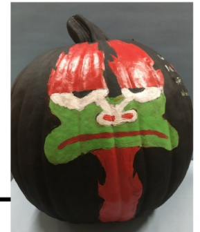
"Gotta Get Back to the Patch"