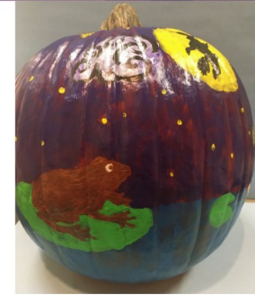
"A Toad May Look at a Witch"