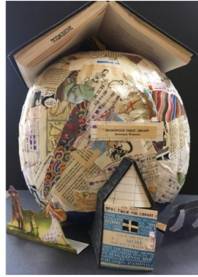
"Shorewood Pumpkin Library"

In what window can you find this little monster?