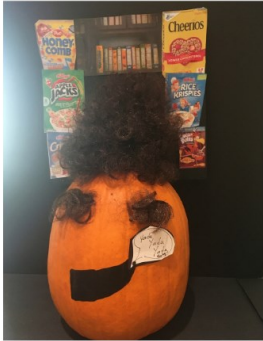
"Yada, Yada, Yada"

In what window can you find this little monster?