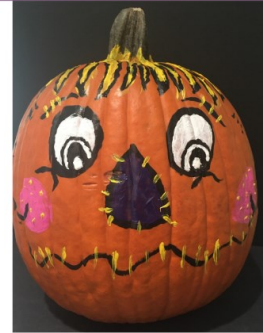
"Smiley, The Happiest Scarecrow"