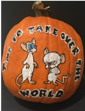
"Pinky and The Brain"