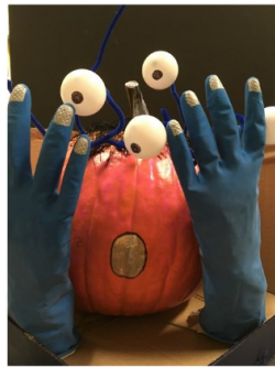
"Peek-a-Boo, I See You...and You, and You, and You"