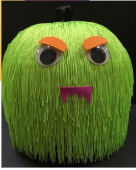
"Electric Green Monster"